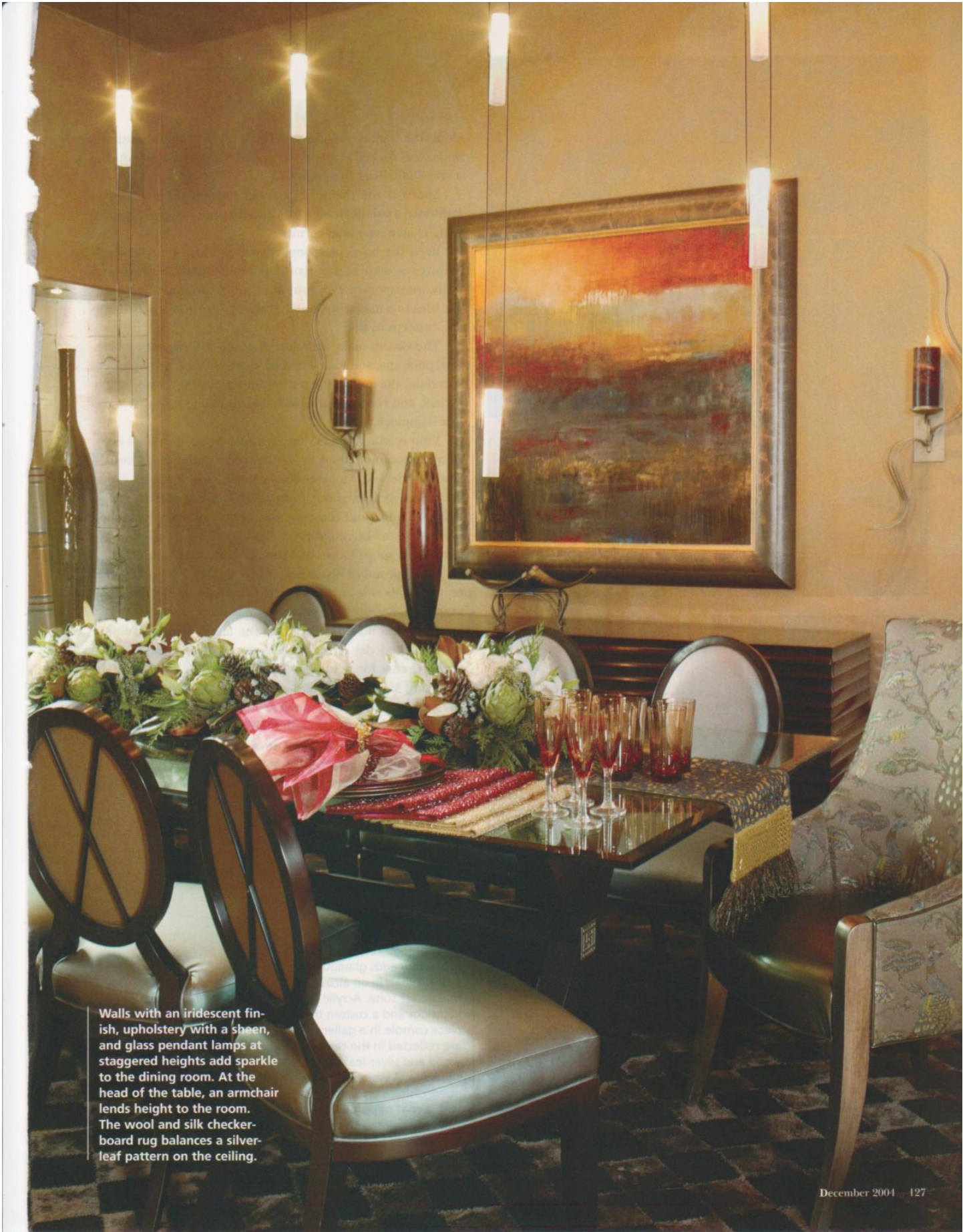
Walls with an iridescent finish, upholstery with a sheen, and glass pendant lamps at staggered heights add sparkle to the dining room. At the head of the table, an armchair lends height to the room. The wool and silk checkerboard rug balances a silver-leaf pattern on the ceiling.